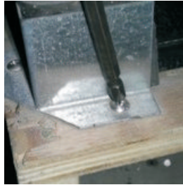
Image 2 Removing bracket from cabinet